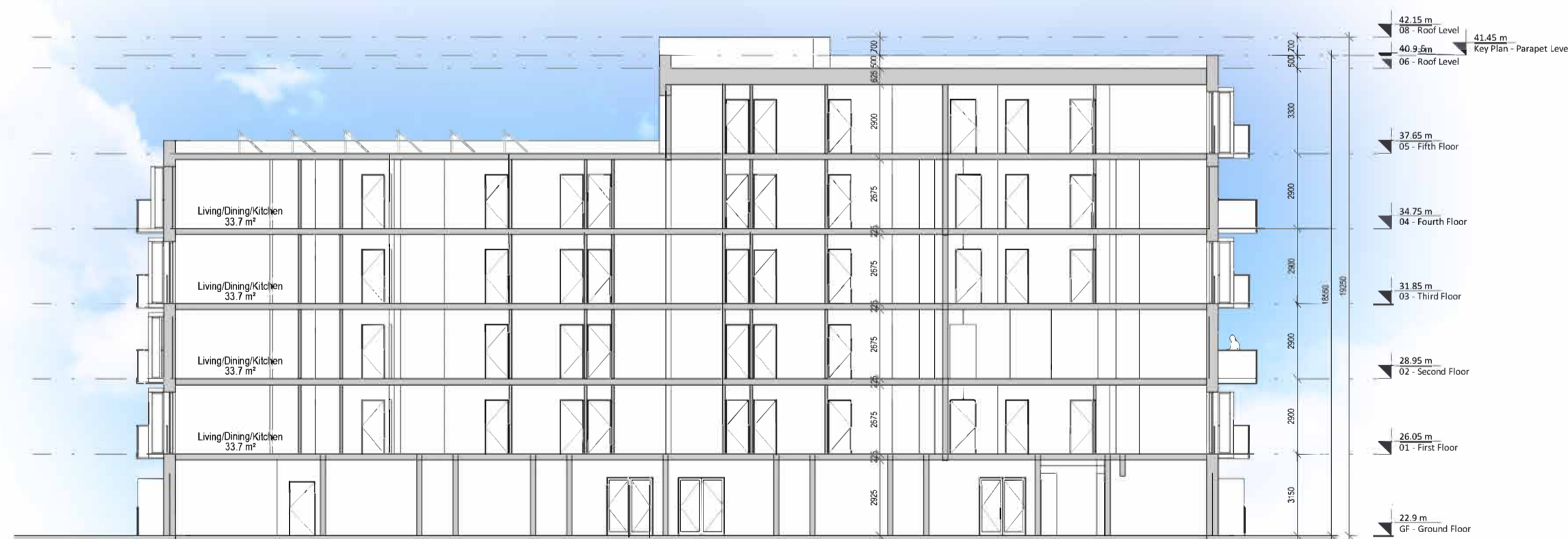
5 Section 1 1:200