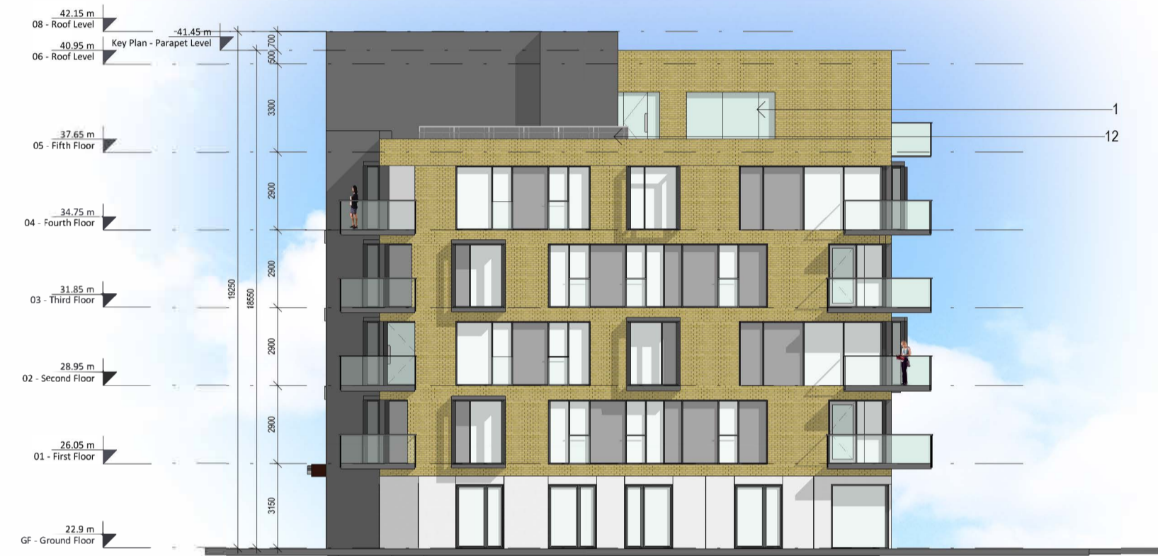
3 South 1:200