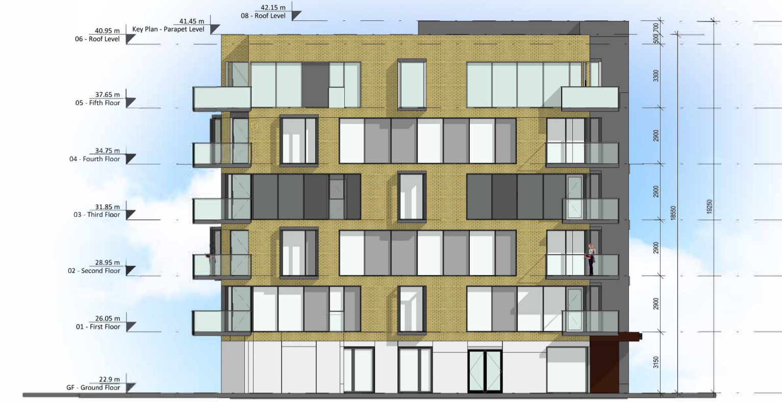
2 North 1:200