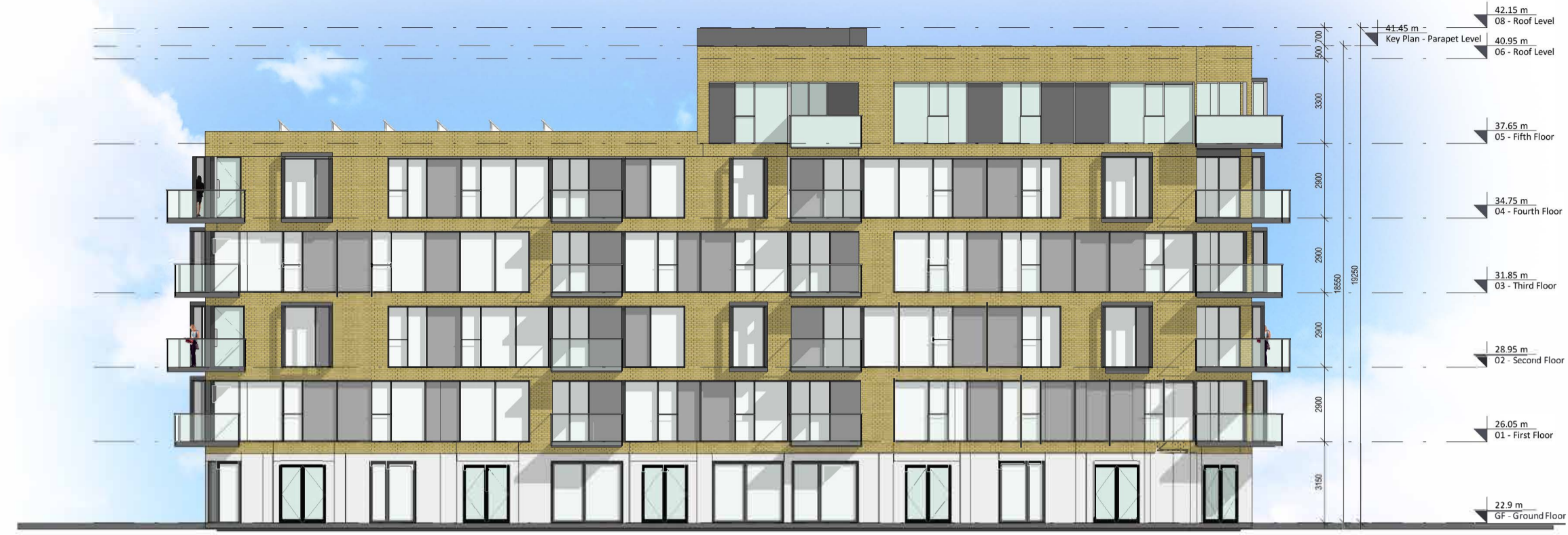
1 East 1:200