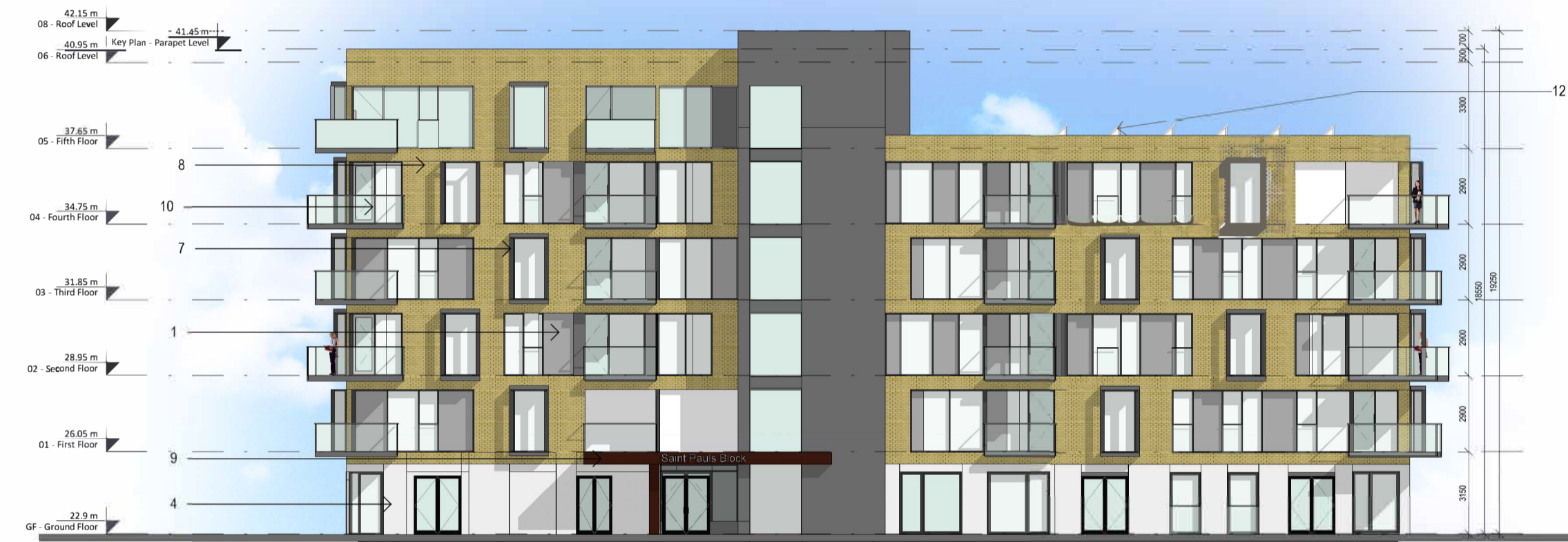
4 West 1:200